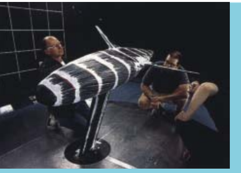
Two PACT95 Engineers inspecting an early hull design of Young America in a Wind Tunnel